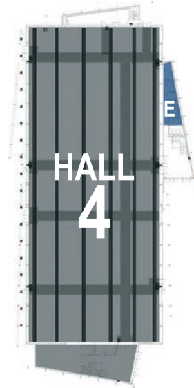
Room E - floorplan

The conference room E is located in the northern part of Hall 4 within the Warsaw EXPO XXI venue. Room is divided by a permanent wall, creating approx. 10 m 2 of separate space. A foyer on a mezzanine is located in front of Room E and offers a view on the entrance area to Hall 4.