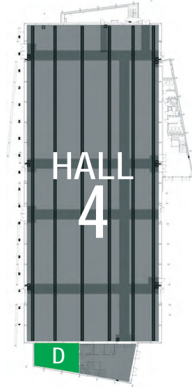
Room D - floorplan